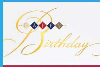
EHB832 Traditional Birthday