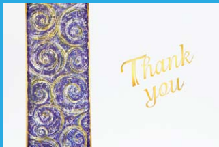
ETY831 Gold Thank You

whilst supporting your favourite Charity at the same time!