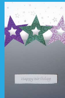
EHB800 Magical Stars

Order online at www.mycharitycards.com.au to receive an additional 5% DISCOUNT!