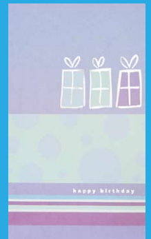
EHB723 Pretty Presents