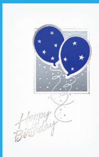
EHB843 Blue Balloons