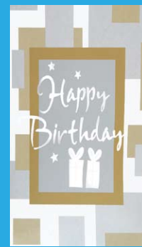
EHB702 Shiny Birthday