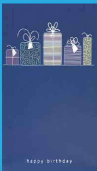
EHB601 Gifts a' plenty