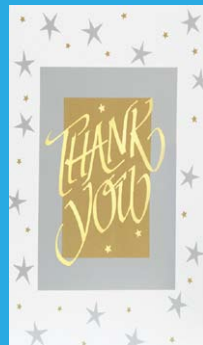
ETY701 Glistening Stars