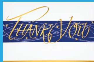
ETY865 Classic Thank You