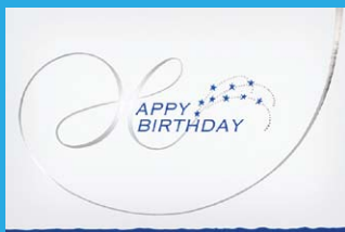
EHB821 Swirly Birthday wishes