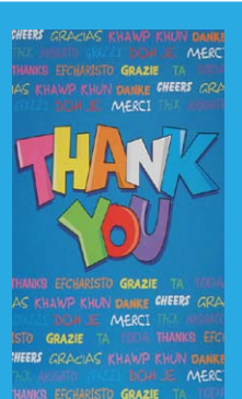
ETY712 Lots of Thank You's