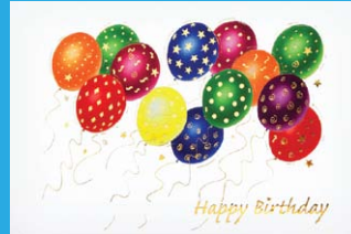
EHB867 Colourful Balloons