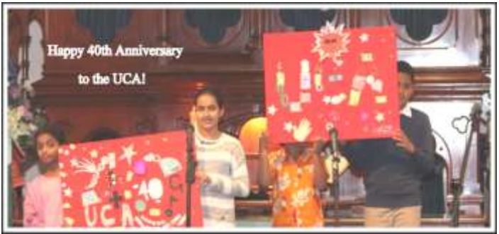
Combined Leigh Fijian & Leigh Memorial kids' anniversary artworks