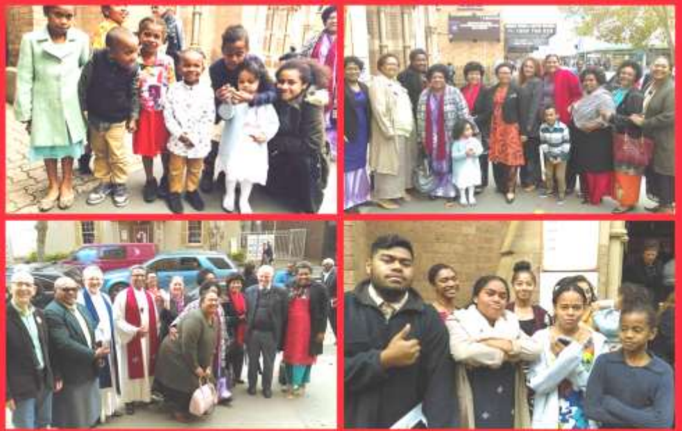
Pilgrim people celebrating 40th anniversary of UCA