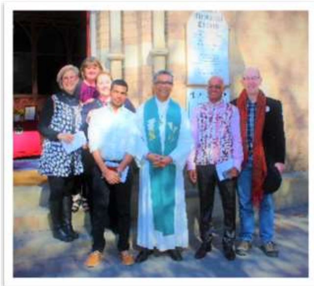
Our Leaders' team for 2018-19.