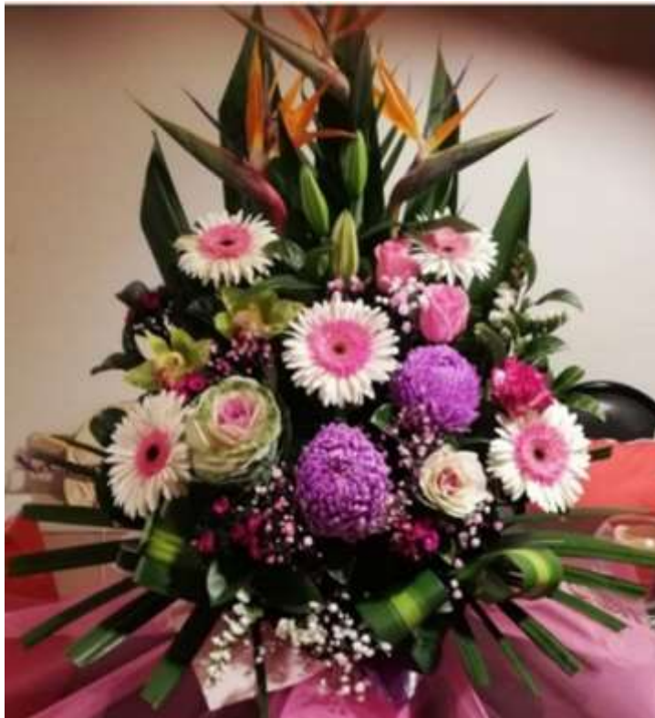
Happy Mothers Day, 2024 (floral arrangement by Adi Akisi Allison)