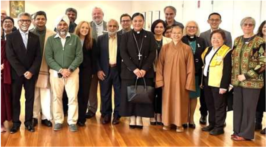
Photo above includes (from left) –